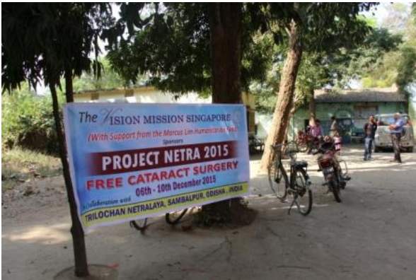
Outreach camp at Sampoch village, 150 kms from Sambalpur