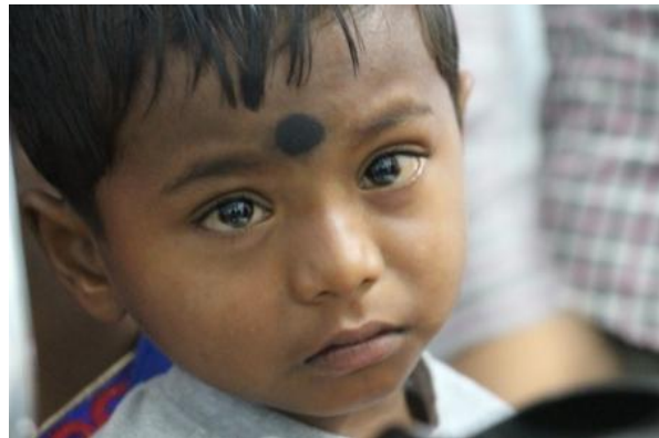
A little boy awaits his turn to be seen by the doctors