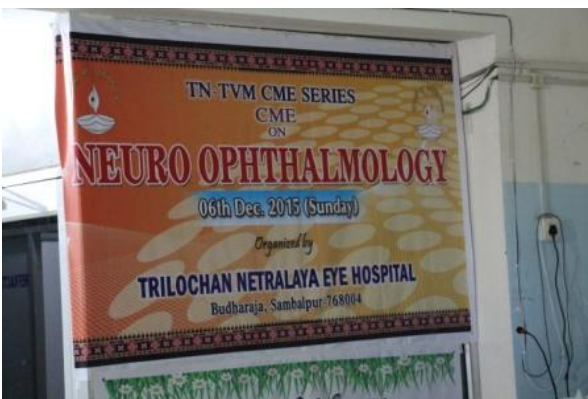
Board at the entrance of the hall where the Continual Medical Education was conducted