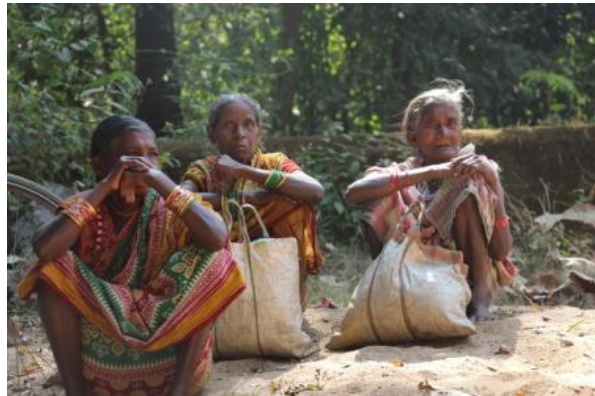
People wait for their turn for eye screening at the outreach camp