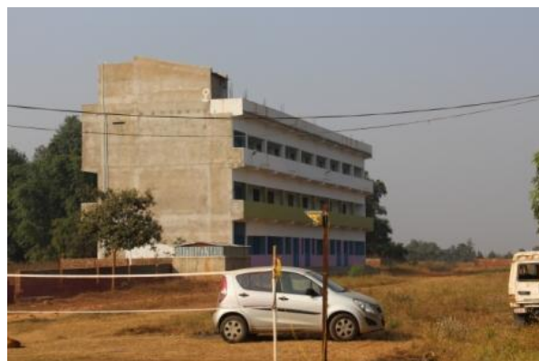
The finished building at Betty's Ashram (that was under construction during our previous visits